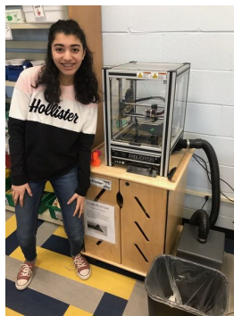
7th Grade Prosthetic Project