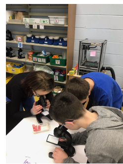
6th Grade using Microscopes